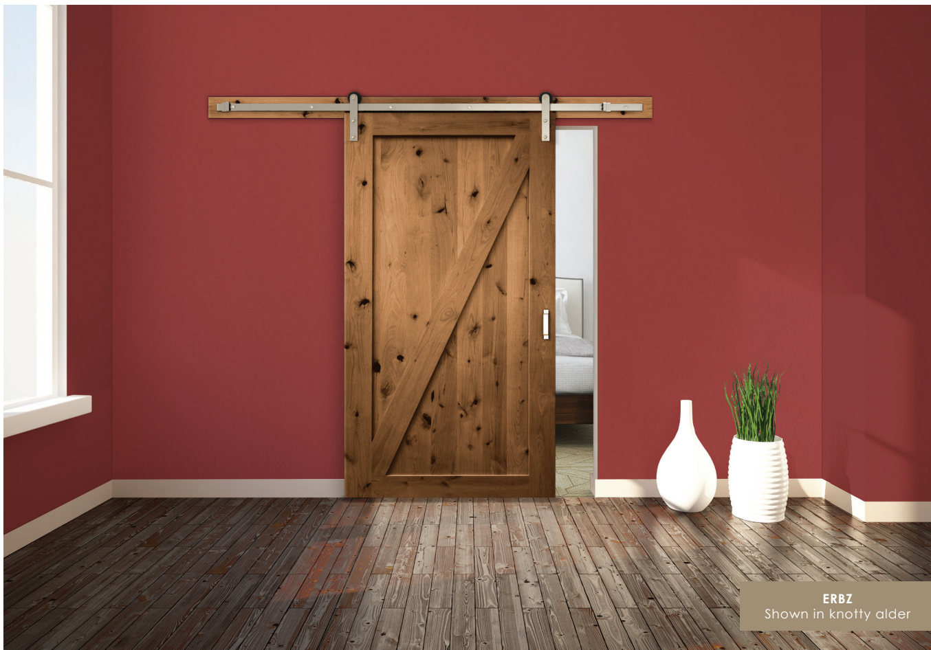
ERBZ Shown in knotty alder