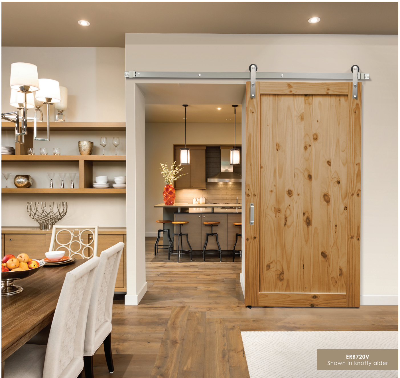
ERB720V Shown in knotty alder

Turn any doorway into a statement by adding a sliding barn door. This versatile door style adds charm and character while making the most of your available space. Customize your barn door to match your style, whether you prefer the rustic look or a more minimalist aesthetic.